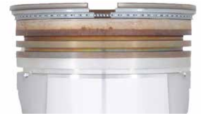
Mobil Pegasus™ 1107

Both products are formulated based on a balanced additive platform in an optimised base stock.