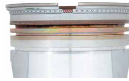
Mobil Pegasus™ 1105