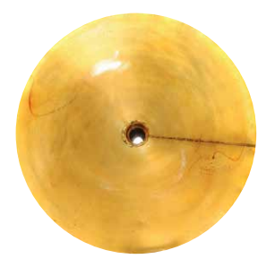
Mobil SHC Cibus<sup>™</sup> 46: pass after 1,250 hours

Mobil SHC Cibus Series lubricants demonstrate long oil life and enhanced system cleanliness versus standard circulating oils as demonstrated in the proprietary Mobil Hydraulic Fluid Durability (MHFD) test rig, where, when comparing ISO VG 46 oils, the level of deposits in the reservoir is significantly less with Mobil SHC Cibus than with the mineral hydraulic oil.