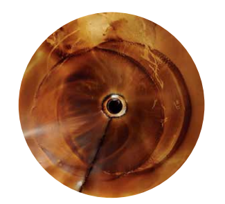
ISO VG 46 Mineral Hydraulic Oil: result after 1,000 hours (actual initial failure at 500 hours)