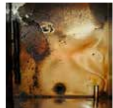
High Performance Synthetic WT gear oil competitor