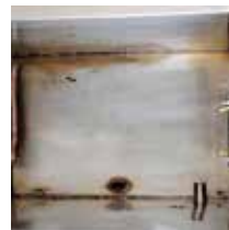
Mobil SHC Gear 320 WT

Fortified with new, low sulphur, extreme pressure technology Mobil SHC Gear 320 WT shows a very low tendency for sludge and deposit formation, helping reduce maintenance and allowing you to generate more electricity at lower costs.